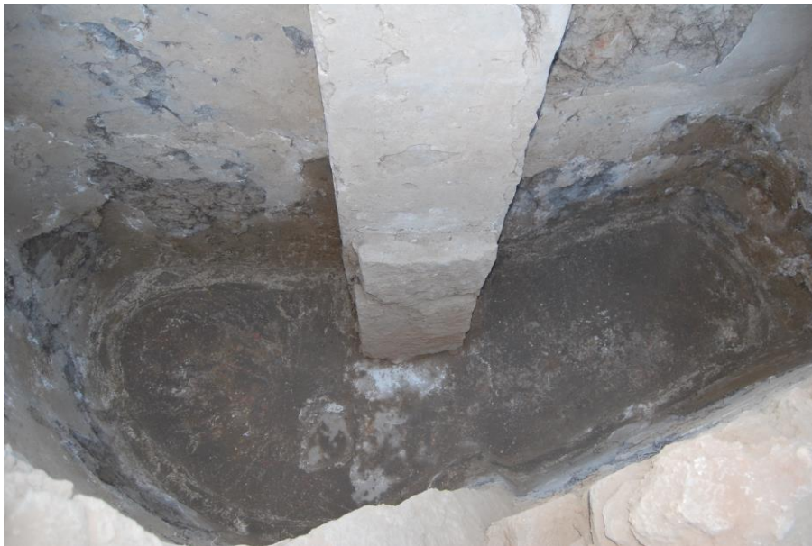
Fig. 9. Nora, Area Gamma, Vano G (ISTHMOS Project).