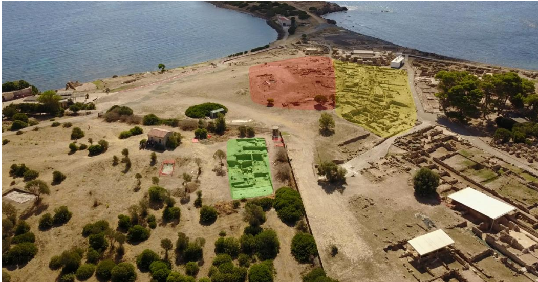
Fig. 2. Nora, aerial photography of the so-called Colle di Tanit. Green: Excavations of the University of Cagliari. Red: the so-called Alto luogo di Tanit. Yellow: the so-called Kasbah (ISTHMOS Project).