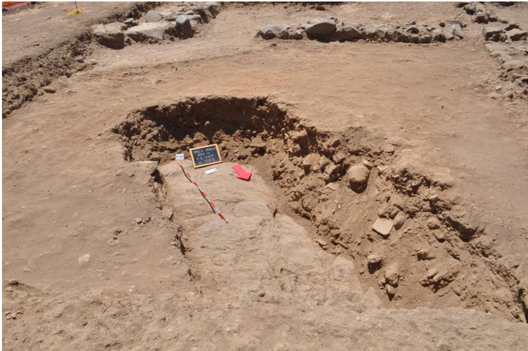
Fig. 6. Nora, pit of the Area Alfa (ISTHMOS Project).