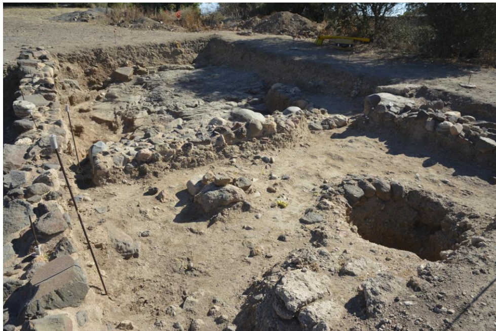
Fig. 7. Nora, Area Alfa (ISTHMOS Project).