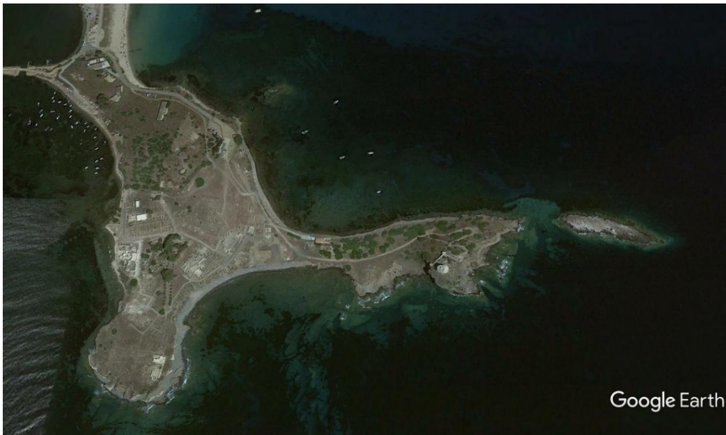
Fig. 1. The peninsula of Nora, South Sardinia.