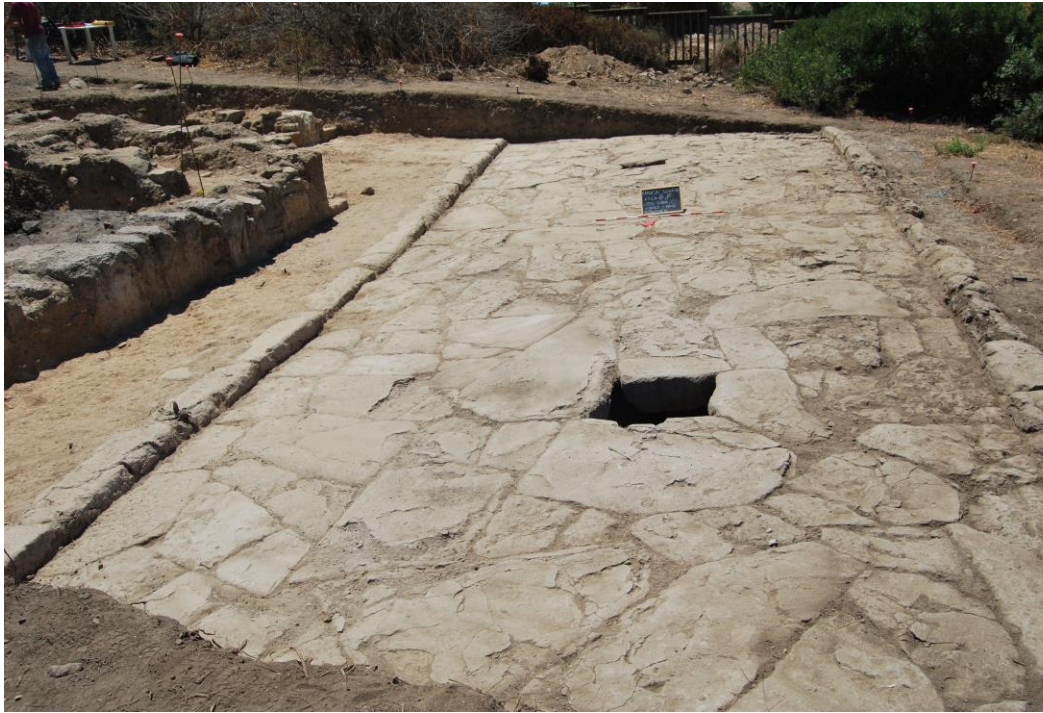
Fig. 4. Nora, the roman road of the Area Beta (ISTHMOS Project).