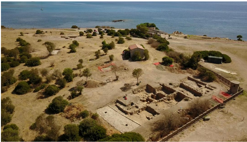
Fig. 3. Nora, aerial photography of the southern area of the former military area: excavations of the University of Cagliari (ISTHMOS Project).