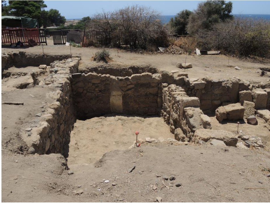
Fig. 8. Nora, Area Gamma III, Vano A (ISTHMOS Project).