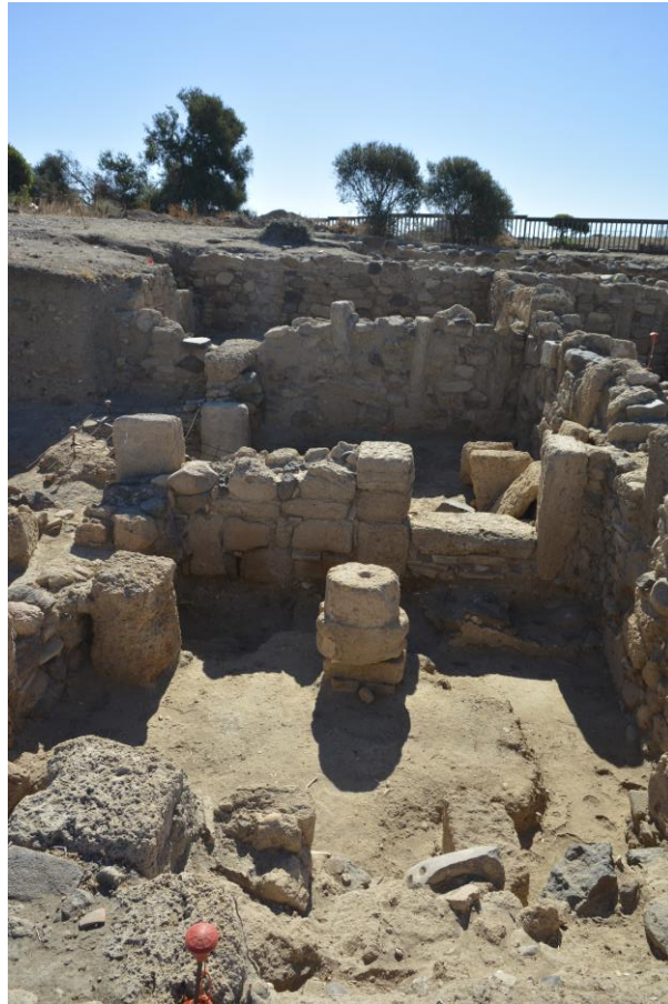
Fig. 10. Nora, Area Gamma II, Vano C (ISTHMOS Project).